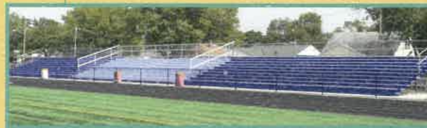
Proposed stadium seating in Field 4

The ultimate goal of the LYSA/CSC Facilities Improvement Plan is to create the finest soccer venue in the state, thus providing an outstanding training and game environment for our players, families, and guests. These enhancements will not only provide better playing surfaces for training and games, but also allow for play on a more regular basis after rain.